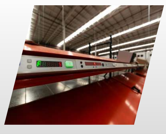
PUT TO LIGHT

Perfect for many SKUs with a medium number of orders.